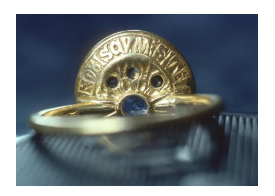
The Pilton Prior's ring: Left, the cabochon sapphire with Hebrew inscription on the bezel;

Right, the reverse with Latin inscription 'Jesu Adonai nobiscum sit' (May Lord Jesus be with us).