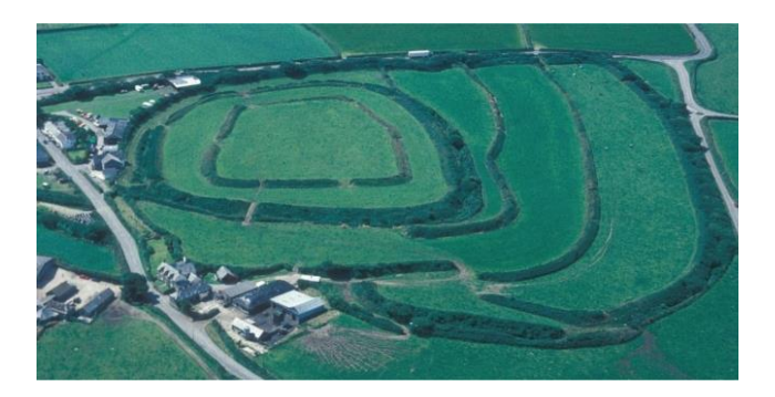
Fig.1: Clovelly Dykes, aerial view to south – East Dyke Farm in the foreground, the A39 in the background.

Hidden from view by the hedge which borders the A39, Clovelly Dykes is one of the most enigmatic yet impressive ancient monuments in the county. Assumed to be an Iron Age 'hillfort' or as some prefer 'multivallate enclosure', its purpose has been much debated. Although high up (c. 210m), it is located on a plateau and is not on the top of a hill in the classic style of 'forts' such as Hembury (near Honiton) which are interpreted as defensive. It does however have "far-reaching views in all