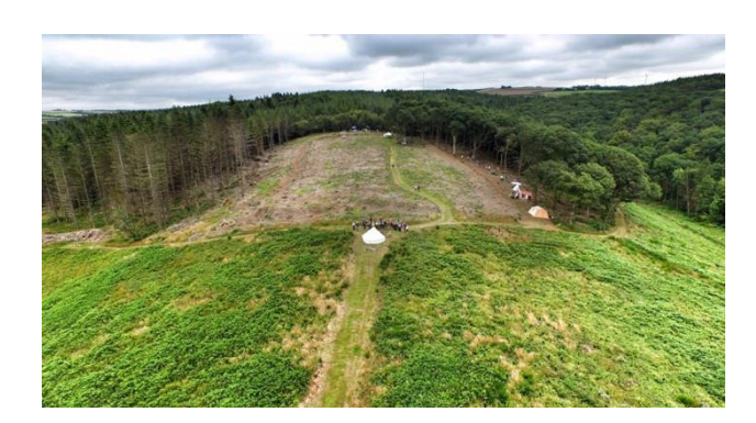
Drone's eye view of Berry Castle at the time of the open day in Summer 2017

There is an opportunity this summer to get your hands dirty and your trowelling skills back in trim. The Friends of Berry Castle (Huntshaw) are planning a week of excavation (18<sup>th</sup> to 25<sup>th</sup> July) at this presumed Iron Age hilltop enclosure in Huntshaw parish (NGR: SS495223). If you want to volunteer, you will find attached to this newsletter a full explanation of the project together with an application form which has to be returned by 15<sup>th</sup> June. There is also an open day on Sunday 22<sup>nd</sup> July, 11.00 am to 3.00 pm.