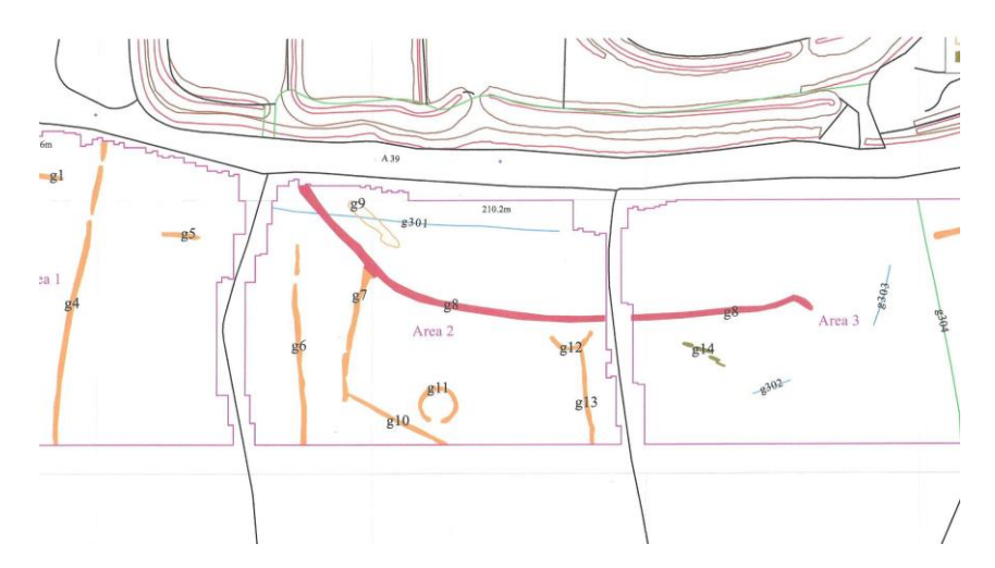
Fig.3: Results of the 2018 geophysical survey, showing in red the possible extension of an outer ditch.

In 2016 therefore, North Devon Archaeological Society (NDAS), in conjunction with North Devon AONB (NDAONB), decided to commission geophysical survey of the field south of the road in order to determine whether there were sufficient remains to warrant further investigation. Phase 1 of the survey was undertaken by Substrata in January 2017. Following